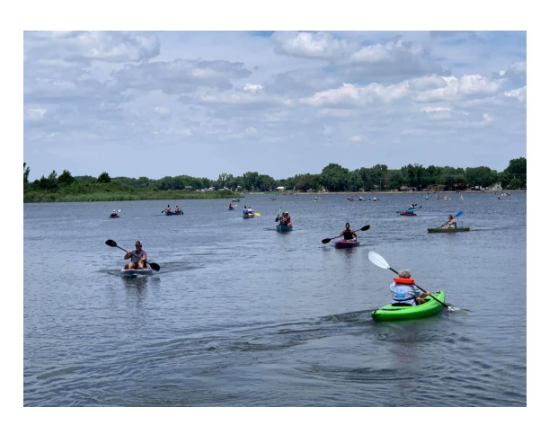
Paddle Poker Registration & T-shirt Orders Click Here

Annual Parade in Ericson Methodist Women's Dinner Wagon Wheel Lunch Buffet Jr. Rodeo at Rodeo Arena Ericson VFD Street Dance